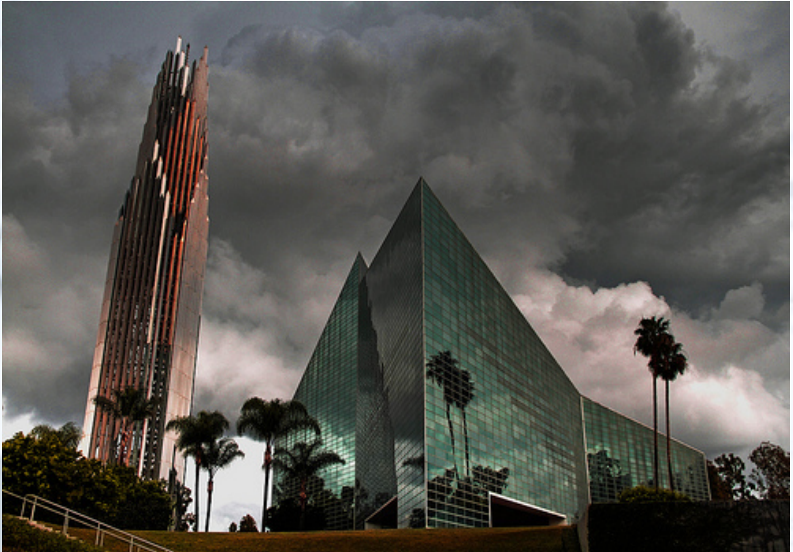
Crystal Cathedral Anaheim, CA